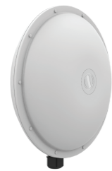
Quick Start Guide ion4I2_CPE